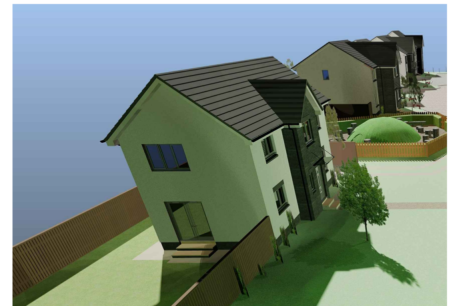
Artist's impression images are subject to check without notice