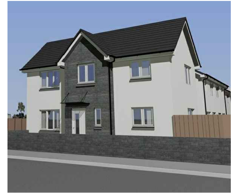
Artist's impression images are subject to check without notice